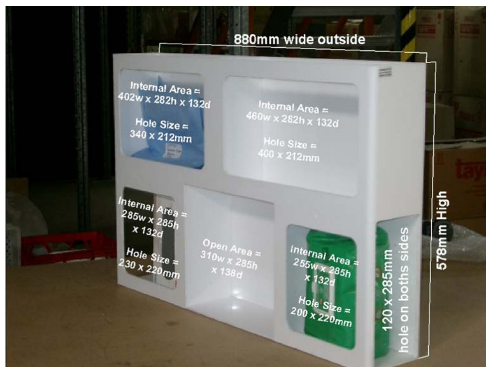
Figure 2: Example of a customized PPE container

Some health services have developed custom solutions to accommodate PPE, as shown in the photo in Figure 2. This type of system can be stocked when required and is easily mounted on a wall reducing the need for trolleys or recessed bays.